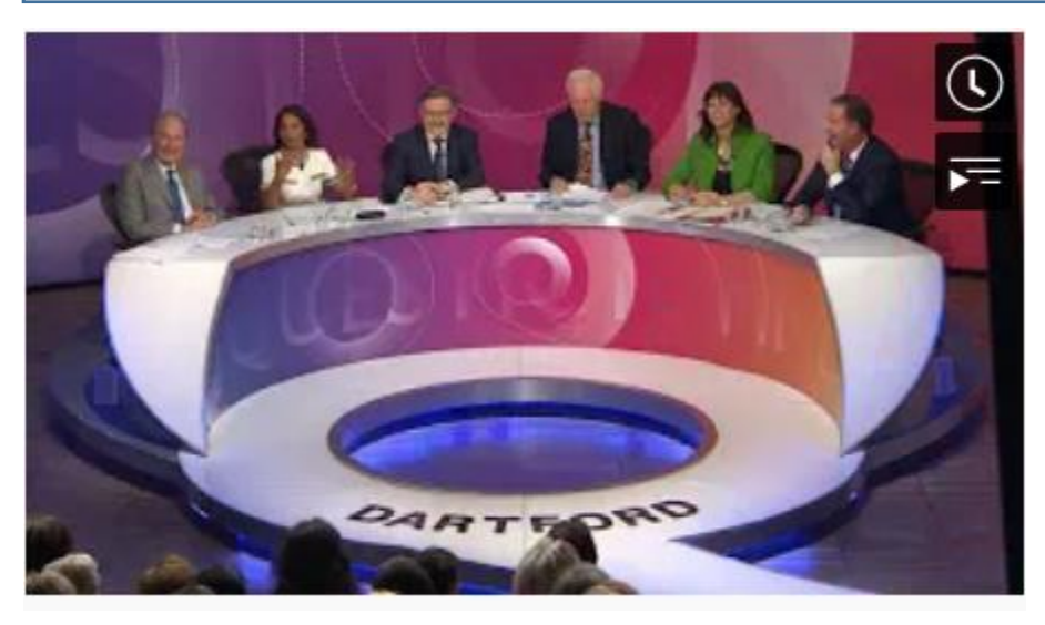
Question Time Theme Music